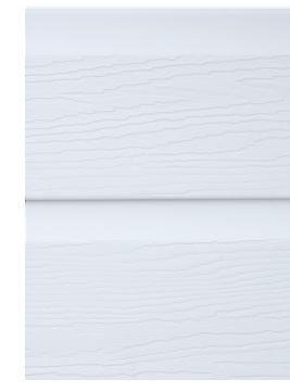
Light Blue X002