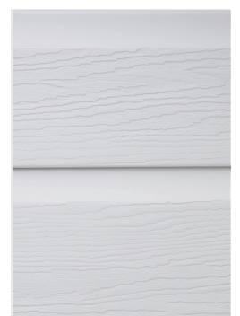
Light Grey RAL 7035