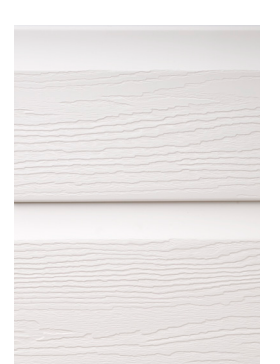
Cream RAL 9001