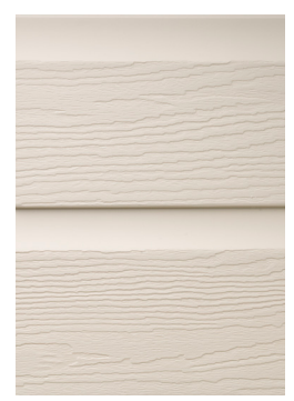
Sand RAL 1015